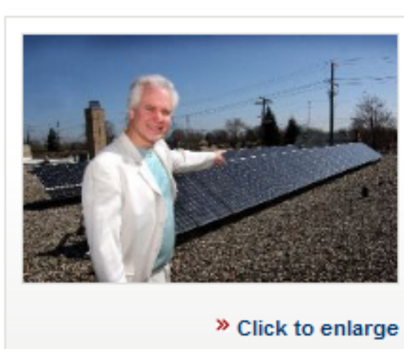
» Click to enlarge

WYANDOTTE — The sun was shining brightly on the day the city and school district kicked off their first-ever solar energy project.